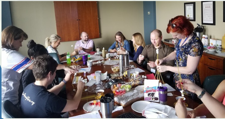
BHR follow-up coordinators enjoy time together with a team-building activity.

Follow-up care has the potential to reduce hospital readmissions and additional emergency department visits.