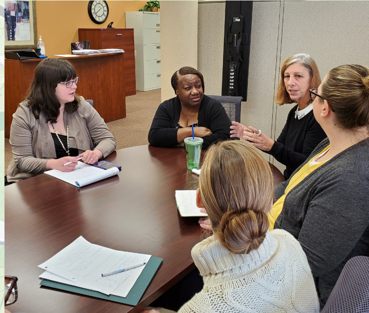
BHN staff are dedicated to developing an accessible and coordinated system of behavioral health care throughout the eastern region of Missouri.